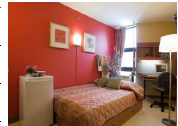
Superior Duo room